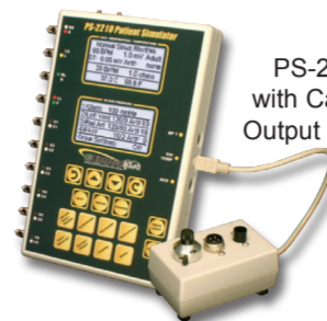
PS-2210 with Cardiac Output Option