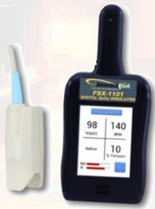
FSX-1101 shown with SPO2 Cuff for size comparison.

Small, Handheld, Lightweight, Rugged Intuitive User Interface Colour Touch Screen Preset & Manual Mode Operation 6 Saturation Levels from 80-99% Heart Rates from 30-245 BPM Adjustable Perfusion Index Pulse Synchronised with NIBP-1000, PS-2100 or PS-2200 Series LIFETIME Warranty*