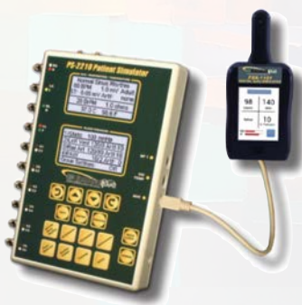
PS 2210 w/FSX-1101

The FSX-1101 is a digital SPO2 simulator with many features, including a LIFETIME